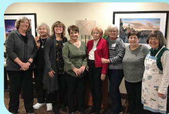
District B Auxiliary Benedictine Living Community of Duluth