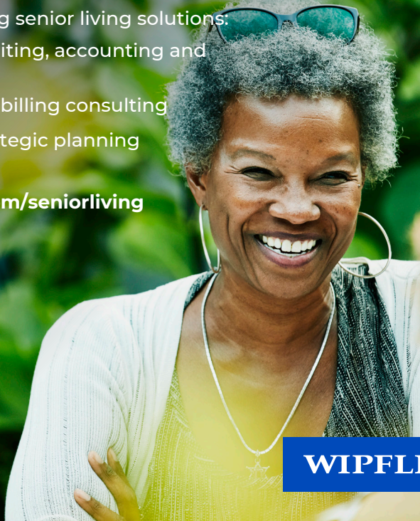
Proud to be a silver sponsor.